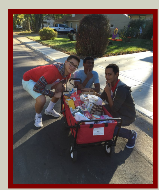
Eagle Service Club at Olathe North Trick or Treat So Others Can Eat - donated to Johnson County Christmas Bureau