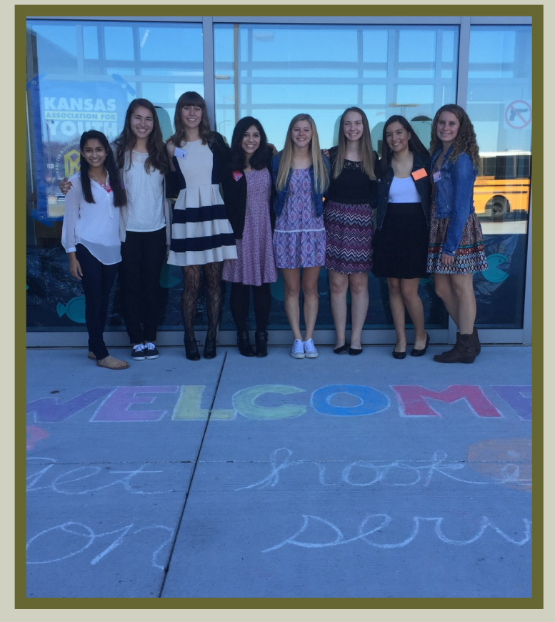
Eagle Service Club-Olathe North Attending regional conference at Lenexa-St. James Academy November 2nd.