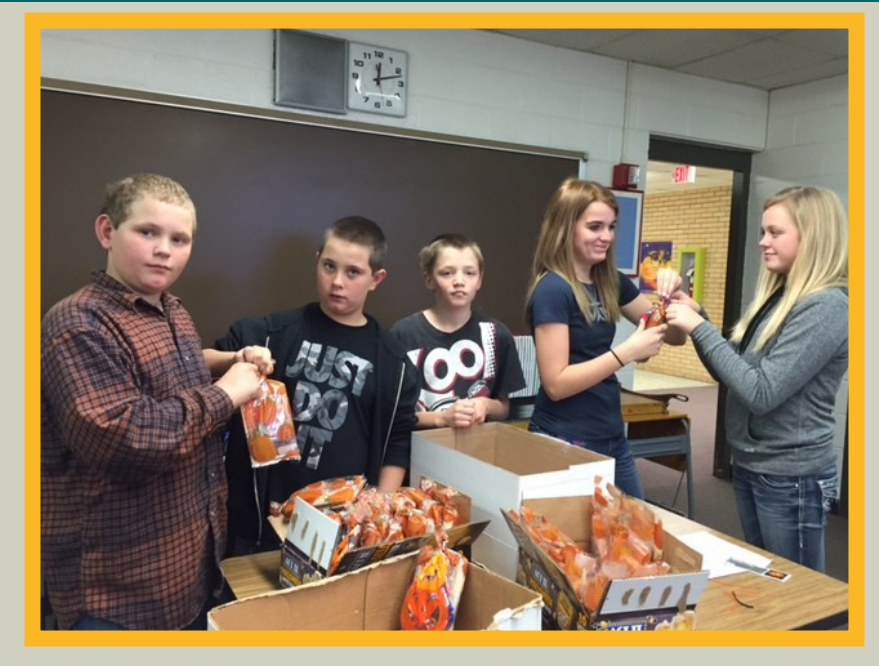
CF-Chase County JH community service project