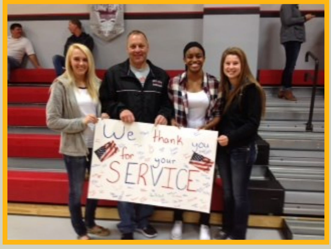
Three members of Hill City KAY Club stop for a picture with their assistant basketball coach and Marine Veteran. The club handed out mints with a slogan to the Veterans at the Hill City Elementary Veteran's Day Program.