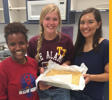
The Olathe North-Eagle Service Club made cookies with thank you notes for Teacher Appreciation.