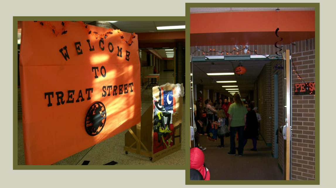
Holcomb High School hosted a Halloween Treat Street. Other clubs and groups also helped with candy booths