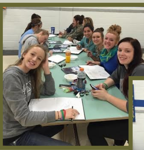
Each fall Thunder Ridge High School KAYS host the Annual Yearbook Signing Party with the Rock/Paper/Scissors Contest. All high school students are invited to attend.