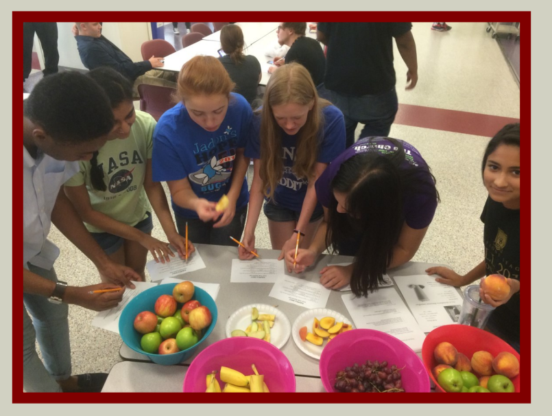
Olathe North's Eagle Service Club complet ing their Area 1 Project with an "Eat-This-Not-That" Survey and a Snack.