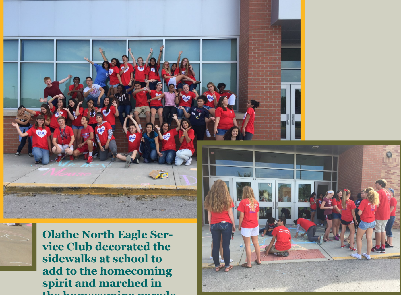
the homecoming parade.